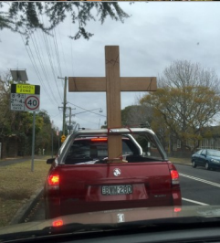
Aug 26 Pilgrims arrive St Bernard's